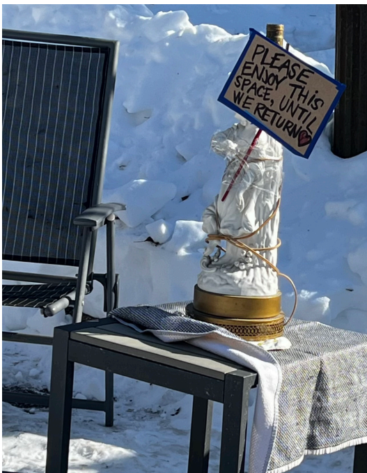
Our neighborhood's creativity on display during the snow event!